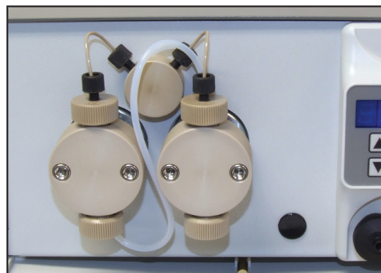
Several Fluid Path Materials Available